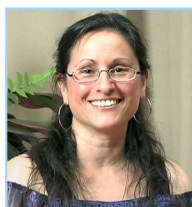
Welcome to NJ Parent Link 01:02